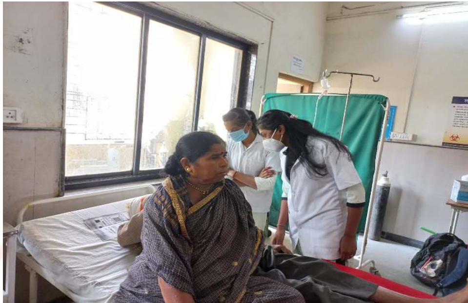
Students observed patents and their case study report

Students study case history of patents .