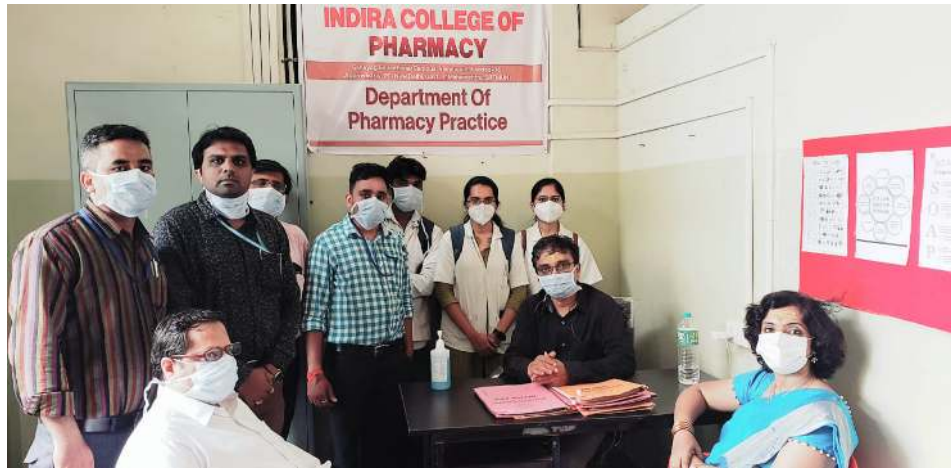
Meeting with HOD of Pharmacology Department